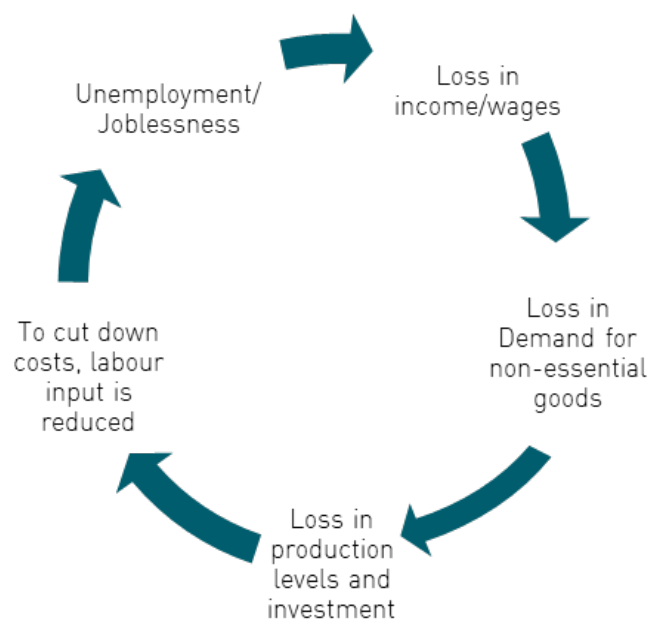
Figure 2: The Vicious Trap

This process has probably pushed India's informal workers into a trap which can be visualised in the following manner: